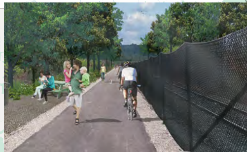
Beacon Rail Trail