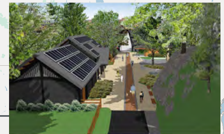
Walkway Over the Hudson