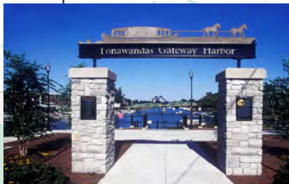
Tonawandas Gateway Harbor