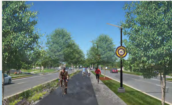
Erie Boulevard Dewitt