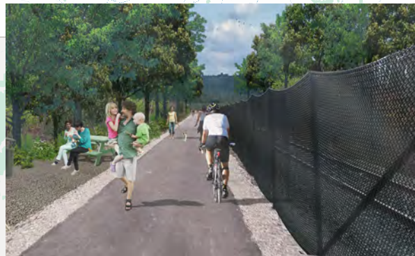
Beacon Rail Trail