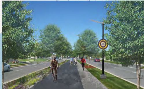
Erie Boulevard Dewitt