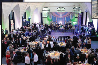
Astor Courts transformed into a gorgeous ballroom