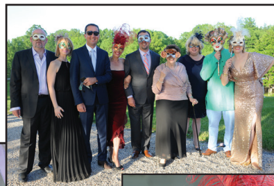
Festive guests enjoying the evening