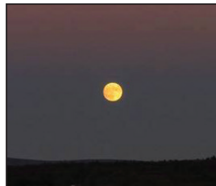
Member Only Full Moon Hikes at Drayton Grant Park at Burger Hill